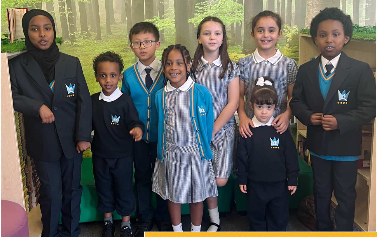
PUPILS IN THE NEW ARK WHITE CITY PRIMARY UNIFORMS